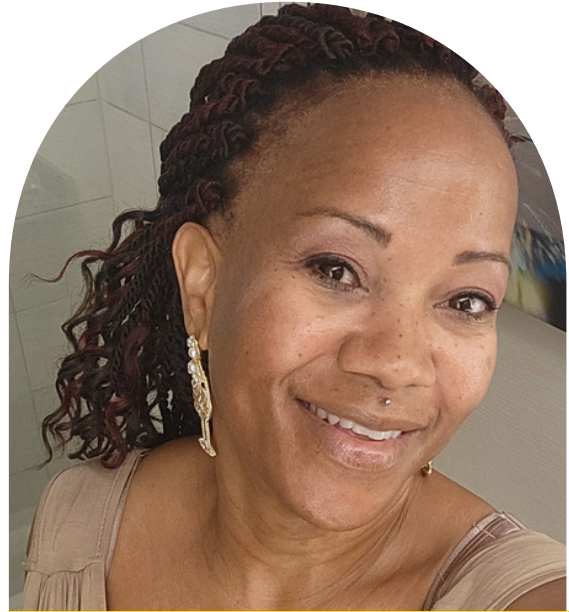
Family Court Strategist & Coach

A family law professional with almost 20 years experience in high conflict divorce and custody. A former family law attorney, certified mediator, trained parent coordinator, certified (pending) divorce coach, blogger, public speaker and ;pro se advocate. Currently providing services to self-represented Family Court litigants nationwide.